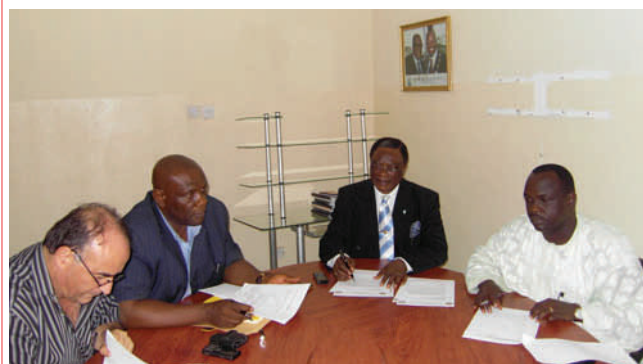
Institute of Appraisers & Cost Engineers board members in a meeting on the 26th April, 2010 in Abuja.